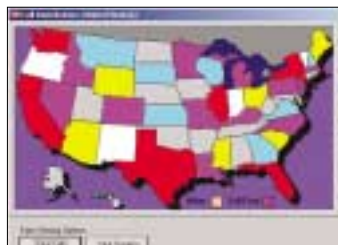
Monitor and analyze geographical call patterns.

S calable, reliable, easy-to-use and powerful, CallAnalyst is a feature-rich call accounting and telemanagement solution for Voice Switching and VoIP platforms. The award-winning solution monitors phone usage, performs customer billing and analyzes traffic patterns and trend studies. A telecom infrastructure management tool, CallAnalyst provides ROI calculations related to VoIP migration.